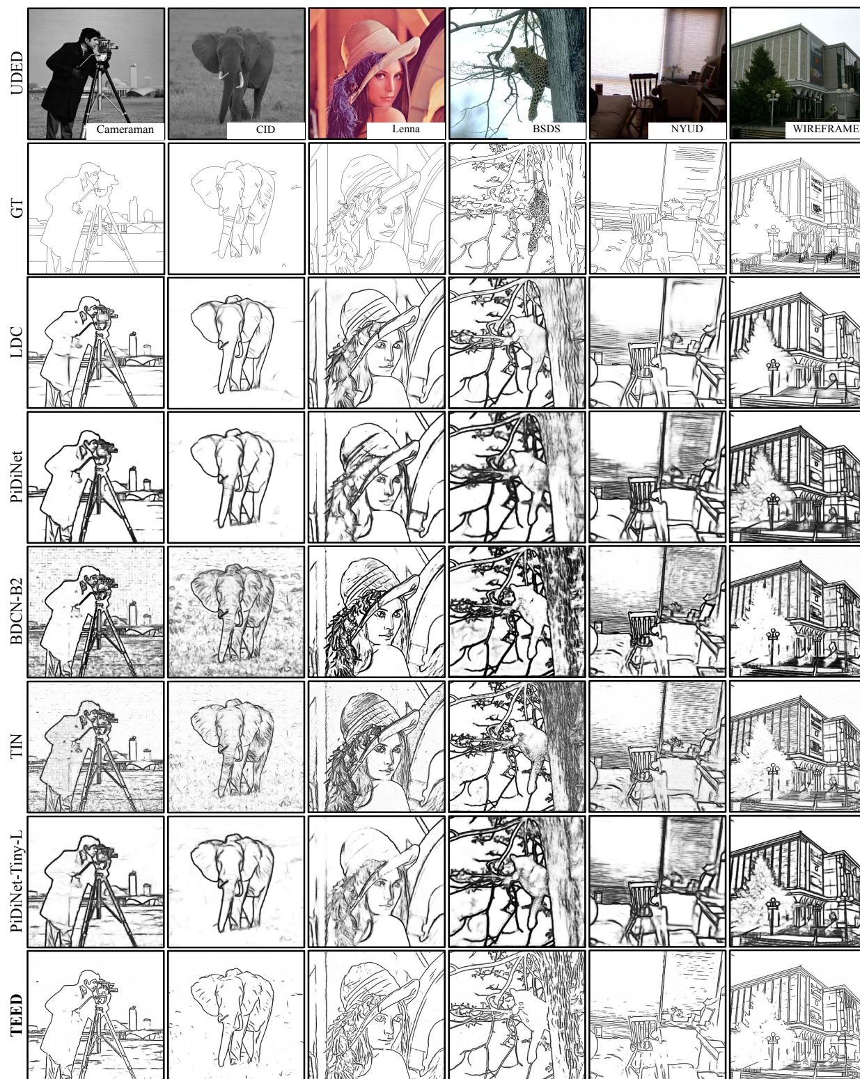
Figure 3: Edge-maps predicted with the lightweight SOTA models and TEED—images from UDED dataset.