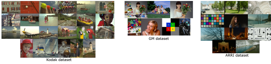
Fig. 2. Datasets used in our experiments.